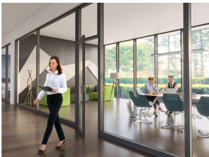
Quiet door closing – for undisturbed concentration in the office.