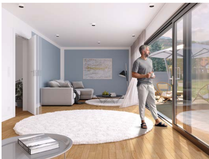
Soft closing- even in strong drafts.