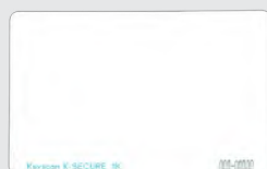
ISO printable cards K-SECURE 1K / 4K available in packs of 10 or 50