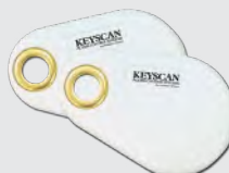
Fob K-SF-1K available in packs of 50 only