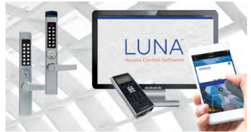
E-Plex offline with Keyscan LUNA and M-Unit handheld