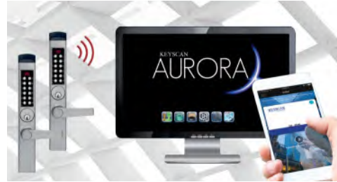
E-Plex Wireless with Keyscan Aurora