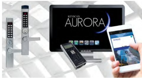
E-Plex offline with Keyscan Aurora and M-Unit handheld