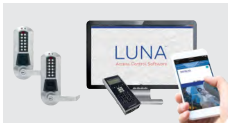
E-Plex offline with Keyscan LUNA and M-Unit handheld