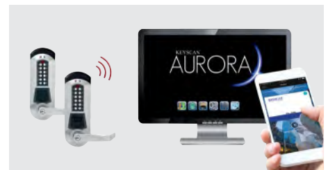
E-Plex Wireless with Keyscan Aurora