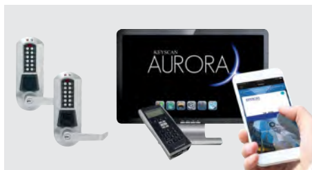
E-Plex 5700 offline with Keyscan LUNA and M-Unit handheld