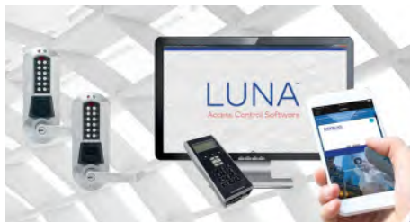
E-Plex offline with Keyscan LUNA and M-Unit handheld