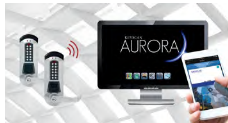
E-Plex Wireless with Keyscan Aurora