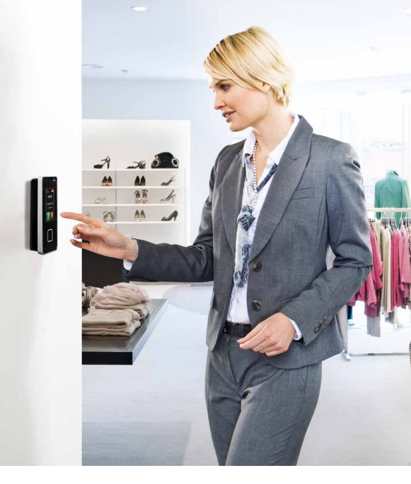
"A central point that everyone passes by once a day? A system that really lightens my workload and is easy to operate?

It doesn't get any better for me as an employee."