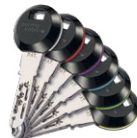
The RFID transponder clips have 6 coloured ring elements for easier identification.