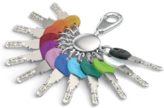
For the default key , there are Smartkey clips in 12 colours.