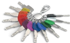
The key with Largekey clip is available in 12 colours.