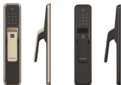
DP850WG White Gold