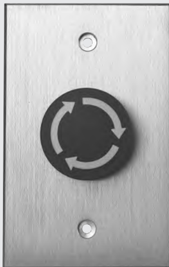
PBRR — 3" x 4-3/4" (76.2 x 120.7 mm)

dormakaba specialty switches prevent users from re-engaging locks in a variety of access control solutions.