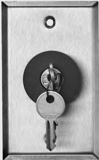
PBKR — 2-3/4" x 4-1/2" (69.9 x 114.3 mm)