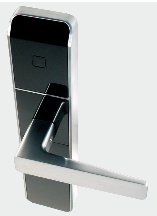
Outside Lock Housing Only