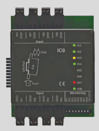
dormakaba extension module 90 31