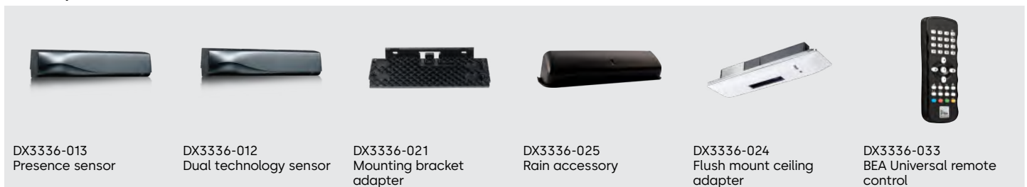
DX3336-013 Presence sensor