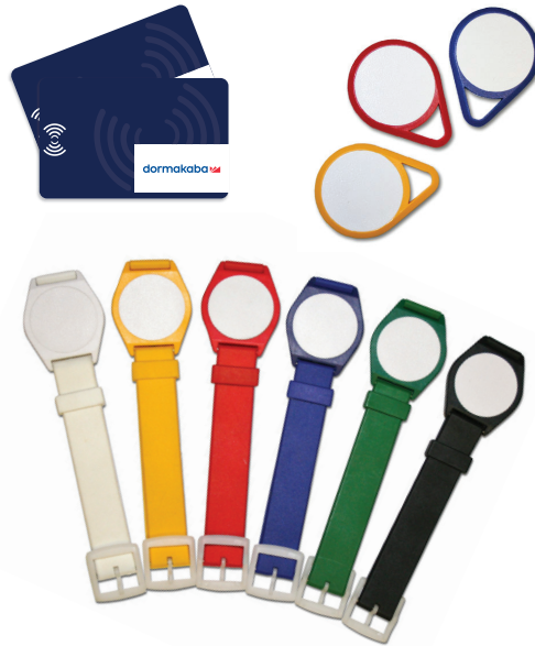
RFID Keycards and Media