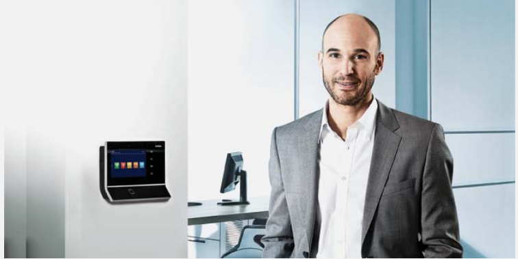
An Enterprise-class Solution B-COMM by Kaba