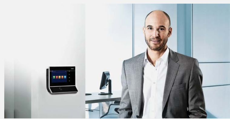
An Enterprise-class Solution