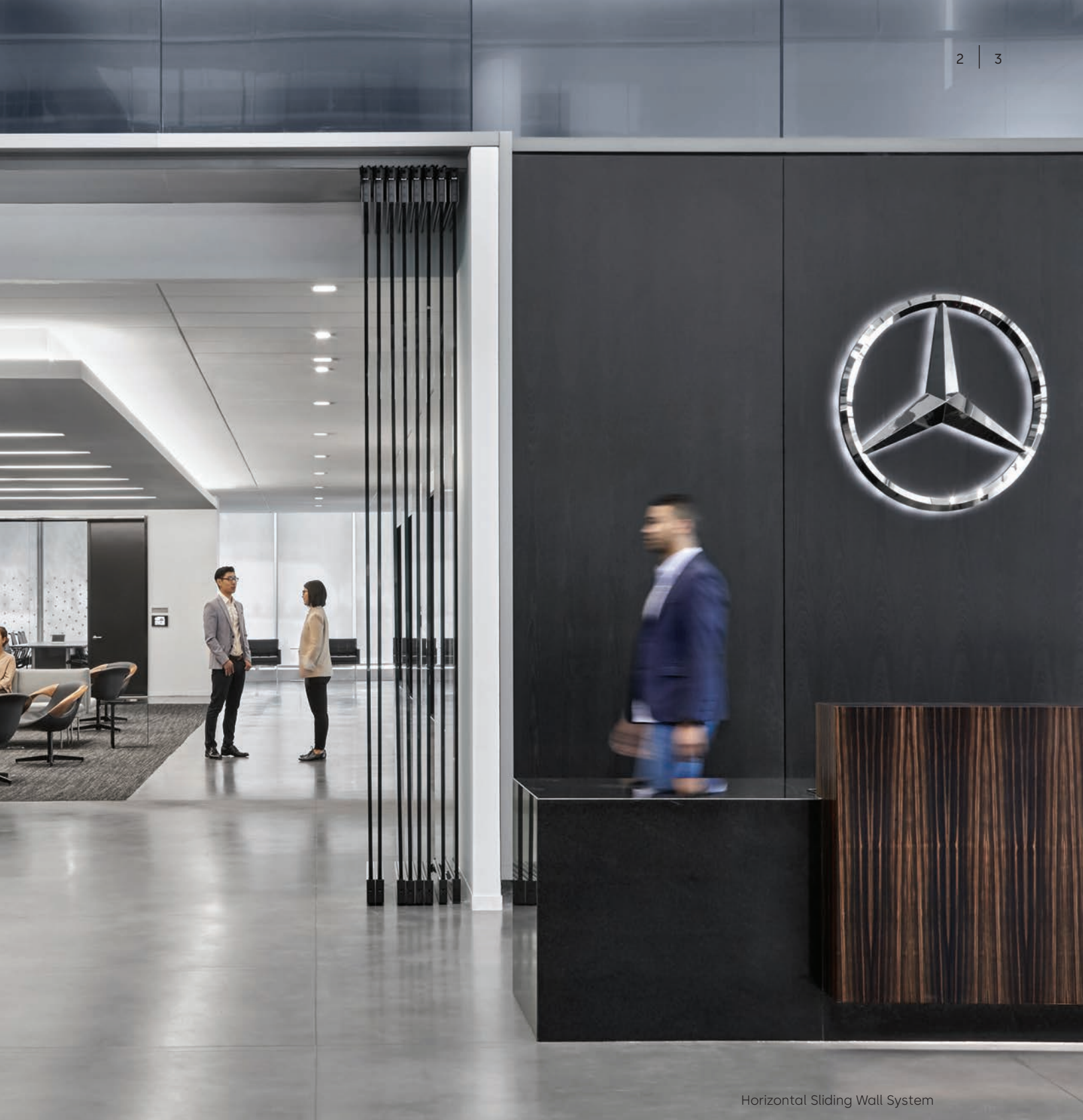
Horizontal Sliding Wall System

Smart design is healthy. You can trust dormakaba glass systems for contemporary design solutions that give clarity to space design.