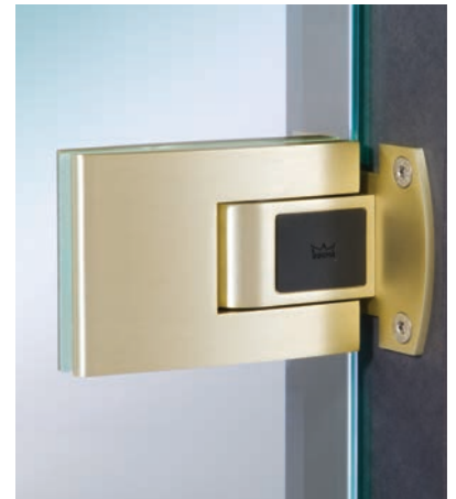
TENSOR double-acting hinge