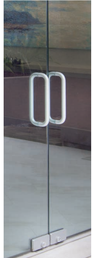
Economy series handles