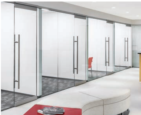
TG 9387 handles