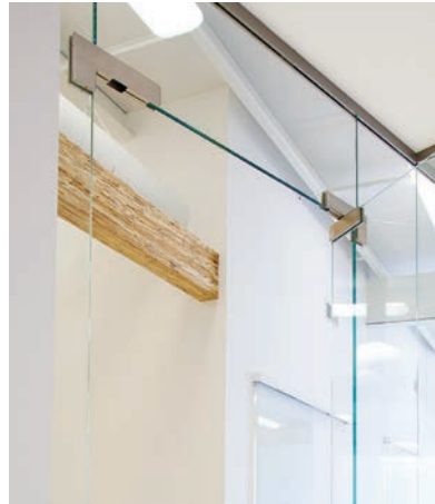
Universal patch fittings

With its broad range of options and configurations, Universal patch fittings are ideal for almost any design. Tempered glass assemblies are provided with fixed parts in a variety of arrangements—with corner fittings or fin fittings for double- or single-acting doors in single- or double-door designs. Universal fittings are supplied standard with gaskets to suit 3/8" (10), 1/2" (12), 5/8" (16) and 3/4" (19) glass.