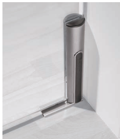
BEYOND swing door system

The unique BEYOND swing door system for glass doors is safe, functional, and attractive. Characterized by its clear styling lines, BEYOND enables you to build frameless swing glass doors into tempered glass assemblies and wall openings.