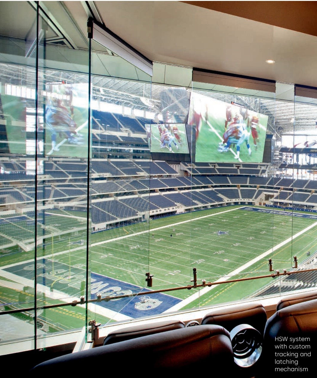
HSW system with custom tracking and latching mechanism

The track can be arranged in a variety of configurations, and sliding panels can be moved without using floor guides or channels. Bolts and locks secure each sliding panel in position and the panels are easy to adjust, align, and operate.