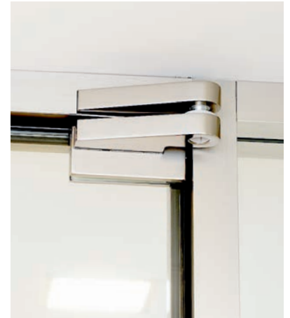
EA offset fittings