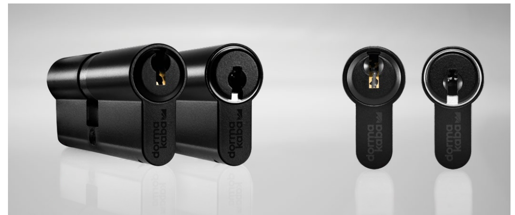
Uniform black for serrated and reversible key systems

Our lock cylinders come in a variety of enhanced finishes. Now, an exciting shade of black has been added, which is available for serrated and reversible key systems.