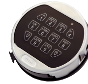
5750-K Round Entry, Audit & eKey II