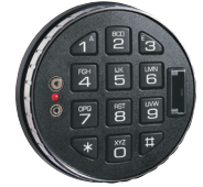
3125 Round Entry, Audit & eKey